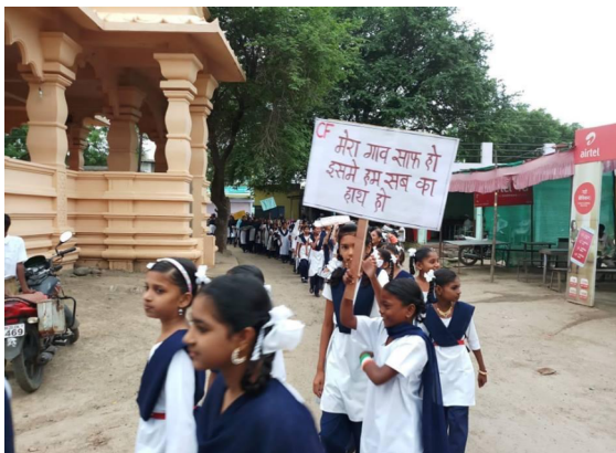
Swachta ki or ek kadam- Cleanliness Campaign